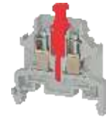
IKTS4 (with TS Plug)

*IKTS4 = IKT4 Blok factory fitted with TS Plug. **IKTS4+P = IKTS4 factory fitted with STB Test Socket screws.