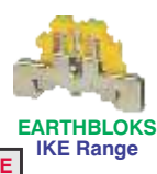
EARTH BLOKS IKE Range